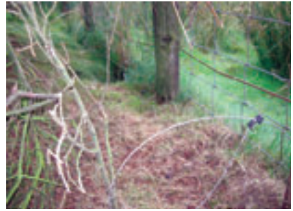
From left to right: Snares set on dragpoles at Wintringham in Yorkshire. Rusty snare set on a fence line at Ripley castle in Yorkshire. Snares hanging on a fence line at Helbeck in Cumbria.