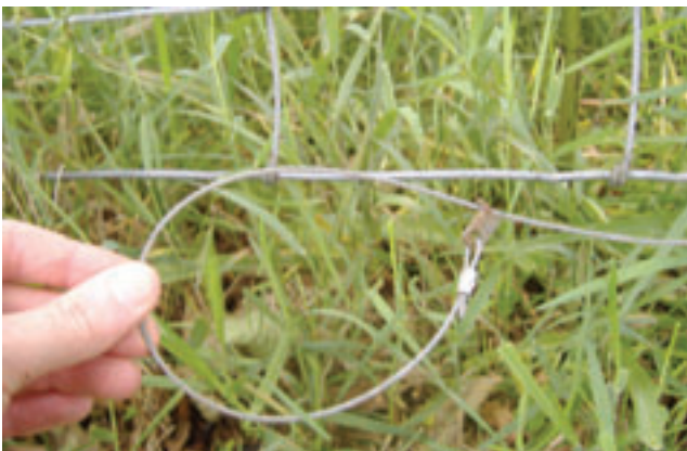
Rusting snare set to a fence line at the Old Hall shoot in Wales.

League investigations involving return visits to shooting estates previously found to be snaring have revealed that many continue to do so – in breach of the DEFRA code of practice.