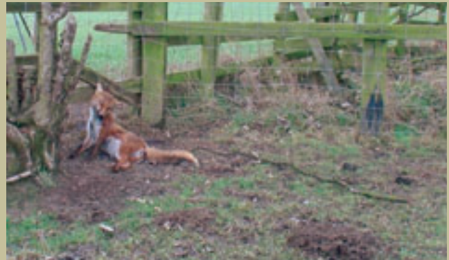
(Archive picture) Fox hanging from a snare set on a wire fence.

What the code says: snares must be firmly anchored so they can on no account become free (because of the great risk to welfare this would cause). Drags should not be used 6 .