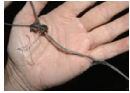
From left to right: Snare attached to a dragpole at Longwitton Shoot in Northumberland. Snare attached to a fence line at Longwitton Shoot in Northumberland. Frayed snare shows evidence of a struggle at Wintringham in Yorkshire.