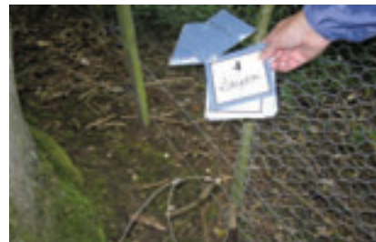
Above: Snares attached to a metal pole that easily comes loose at Mells Park near Frome. Left: Snare set next to a fence at a commercial pheasant shoot at Baydon in Berkshire.