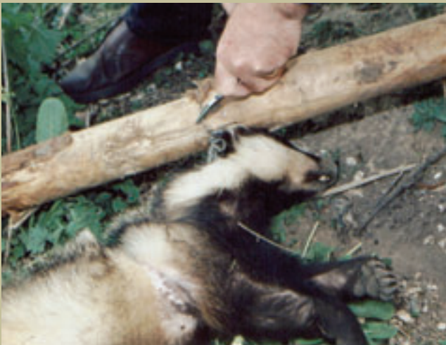
(Archive picture) Goodwood badger snared on a dragpole.

Although the League believes all snaring to be cruel and unnecessary (see The Killing Game 1: Out of Control Predator Control report for background material on previous investigations and case studies 4 ), the use of drag poles greatly increases the chances of an animal suffering a prolonged, agonising death – chiefly because a strong animal can carry the pole off and suffer in secret, perhaps becoming entangled on an overhang and dying of strangulation. Gamekeepers are potentially unable to check snares once a day- as required by law- as they may have been dragged away by trapped animals.